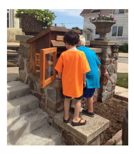
The front porch of Belle Isle Inn in Algoma is within easy reach of small chidlren