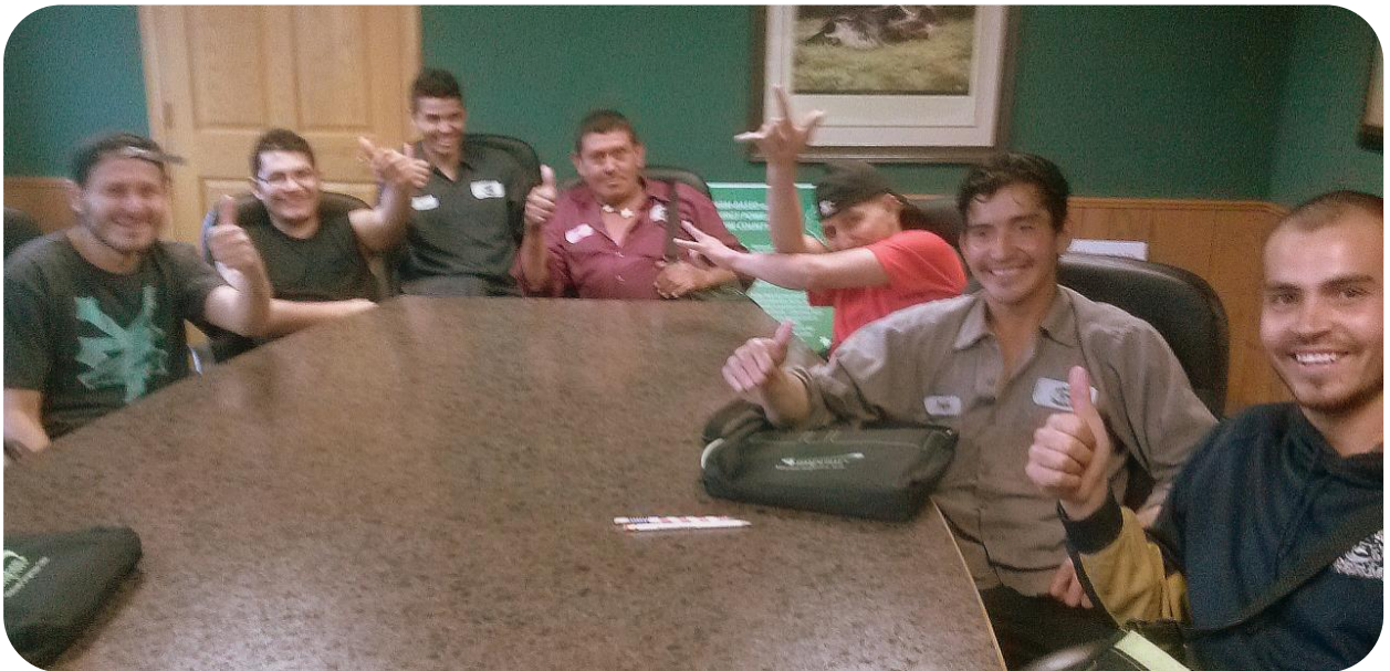
Pictured are some of the students in our Dairy Dreams (farm) class. When asked “How do you like class?”, they gave a thumbs up! The class started with 17 students. Currently, we are working with 9.

I cannot be specific at this time, since a final review is three months away. At this point, I will say that there have been many challenges along the way. Learning how to run a beginning ESL class has been a complete learning experience for us all. I will say, at this point, I’m glad we are running this pilot and am proud to be on the team. We showed extreme flexibility, insight, and a never quit attitude. This team has decades of teaching experience, with a combined adult literacy (ESL) experience of over 25 years. Working and planning together, along with the help of the farm owner and his manager, this program will prove to be a success. The class is much smaller now due to terminations on the job and workers moving on to new positions.