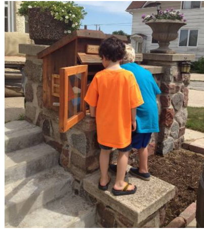
The front porch of Belle Isle Inn in Algoma is within easy reach of small children