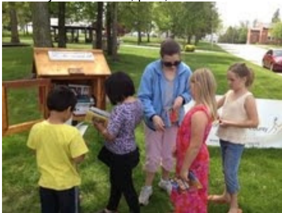
Children gather at the Fireman's Park in Luxemburg

Some of the comments left in the libraries so far include: