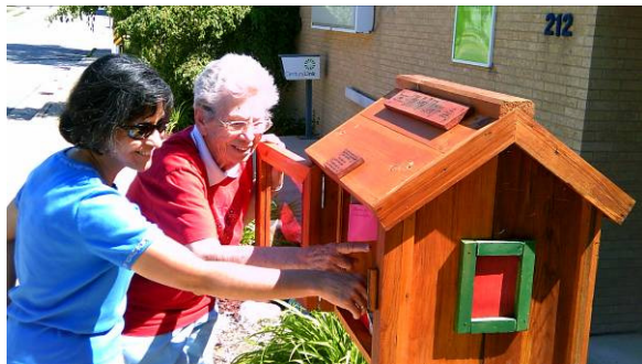
CenturyLink office hosts the Casco location.