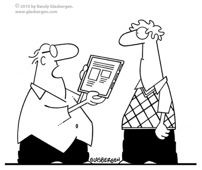
"It will never catch on. You can't train a puppy on an electronic newspaper!"